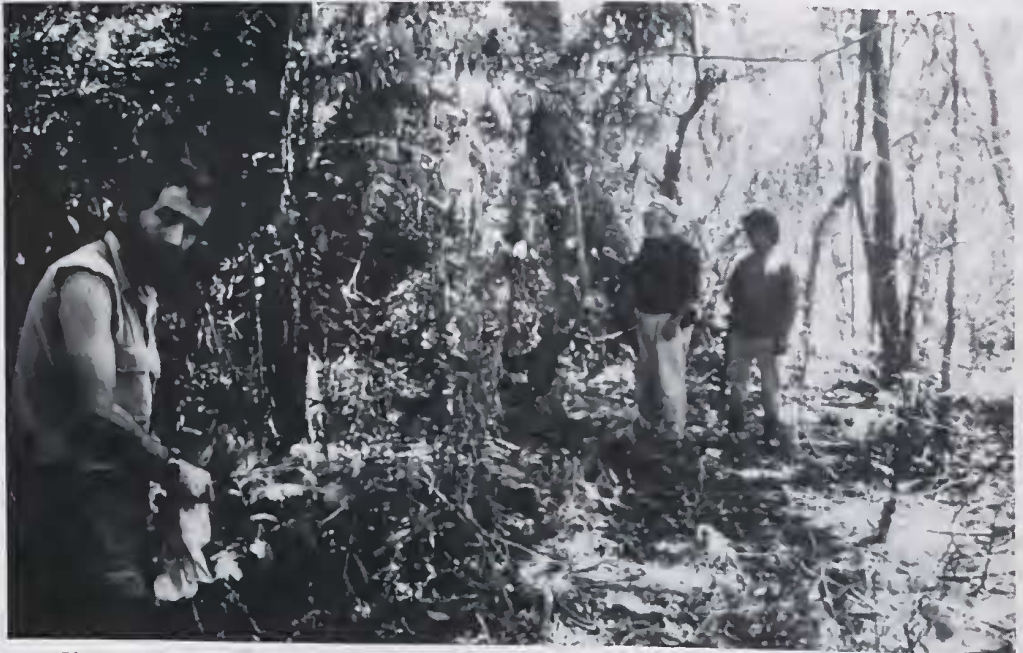
Figure 4 Photograph of the habitat at Lorulun, Yamdena Island – type locality of Melomys cooperae sp. nov..

to rump lengths of one set of these foetuses was c. 14.5 and the other c. 19.2. Of the two females collected two weeks later on 2 May 1993, one had two near-term foetuses (crown to rump lengths 30.2 and 39.3), with one in each uterine horn; the other female appeared to have recently given birth because its uterine horns were large, incompletely involuted and extremely vascular along their internal margin (although no clear implantation sites were apparent). The two males collected on 2 May had scrotal testes with prominent epididymides. The male collected on 18 April (WAM M43823) was subadult and had small abdominal testes with dimensions of 4.1 x 6.5.